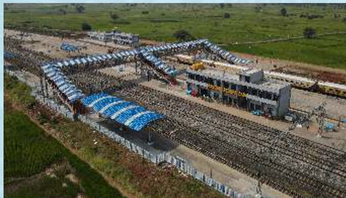
FOOT OVER BRIDGE (MULTI SPAN) SAMBRA RAILWAY STATION