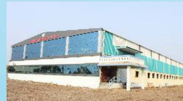
Sai Shakti Polysacks 30,000 sqft (Mudhol)