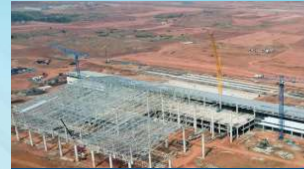
Manohar International Airport (Goa)