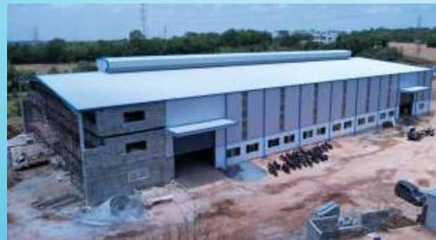
Sthira Technovation Pvt Ltd 40,000 sqft (Dharwad)