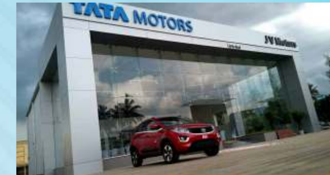
JV Motors 10,000 sqft (Mudhol)