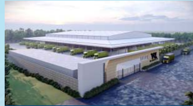
VRL Godown 1,60,000 sqft (Hubli)