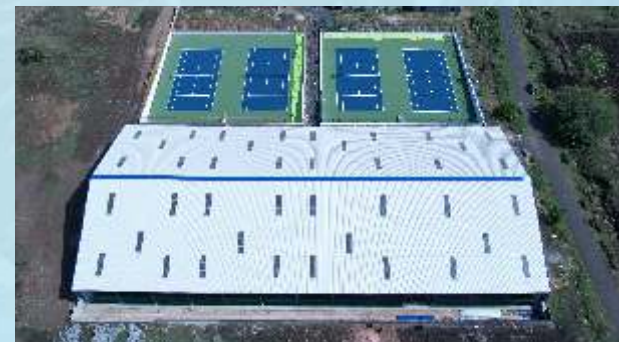
All India Sports Club 40,000 sqft (Belagavi)