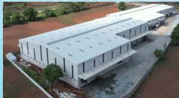
Koliwad Estates 40,000 sqft (Hubli)