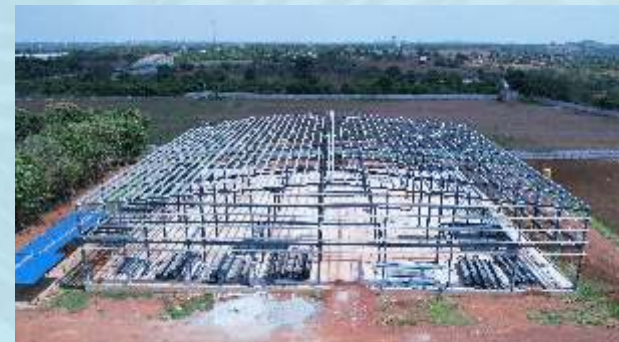
Raksham Medical Devices 60,000 sqft (Hubli)