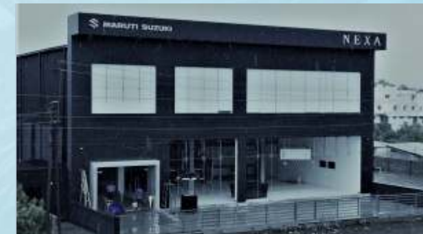
Nexa Showroom 10,000 sqft (Satara)