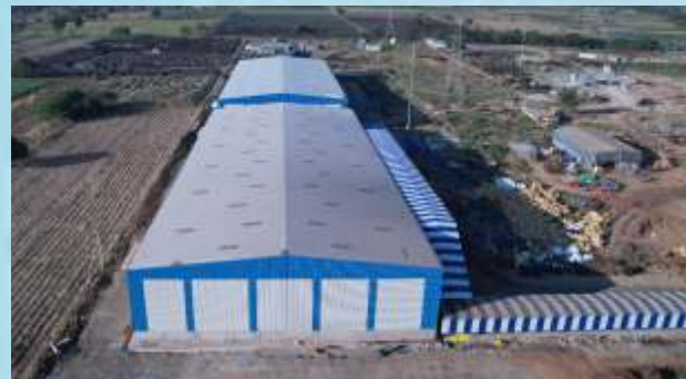
Inamdar Sugars 80,000 sqft (Bailhongal)