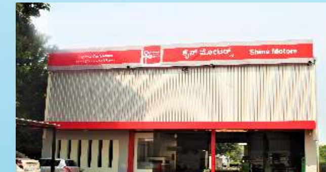
Shine Motors 30,000 sqft (Gangawati)