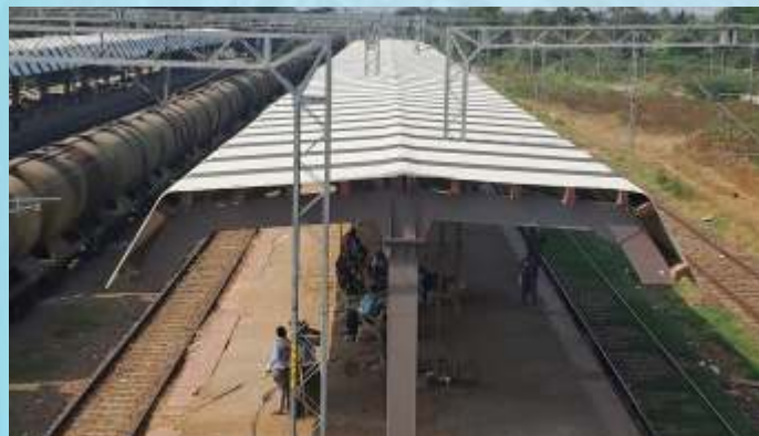
UMBRELLA PLATFORM SHELTER