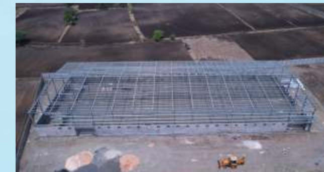
AISPL 30,000 sqft (Belagavi)