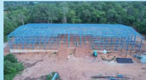
Cold Storage 35,000 sqft (Sirsi)