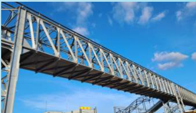
BOX TYPE FOB- SINGLE SPAN