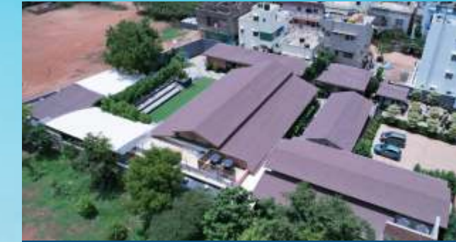
Vishwachetana Patanjali 40,000 (Hubli)