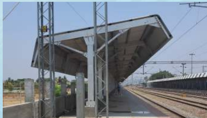
PLATFORM SHELTER [(MONO SLOPE STRUCTURE) MUNIRABAD RAILWAY STATION