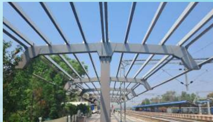
PLATFORM SHELTER (UMBRELLA STRUCTURE) GADAG RAILWAY STATION