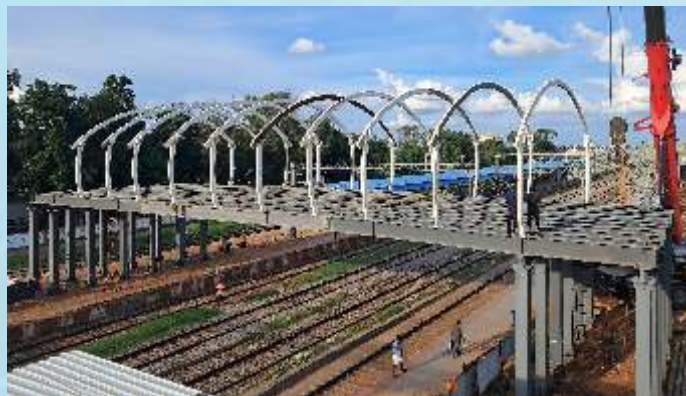
12 MT WIDE GIRDER TYPE FOB