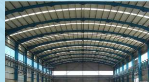
Arch Shed Hotel 10,000 sqft (Yadwad)