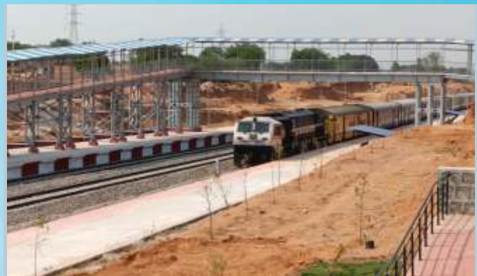
GIRDER TYPE FOB WITH RAMP