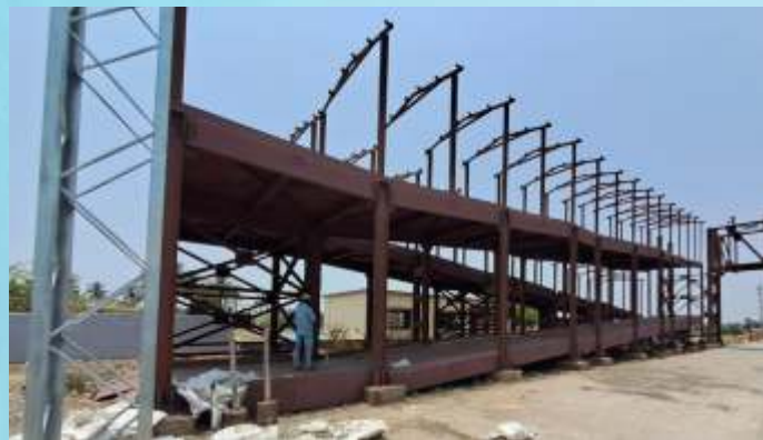
FOOT OVER BRIDGE (DOG LEGGED RAMP) SHEDBAL RAILWAY STATION

4000Metric Ton of work completed in a span of 1 year