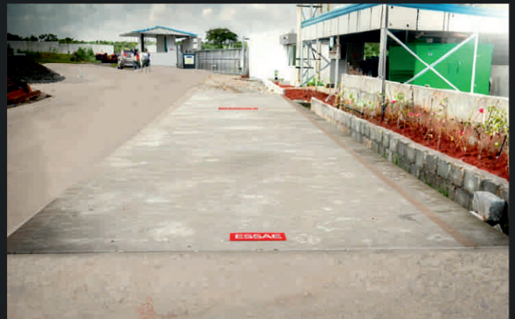
100MT Weigh Bridge