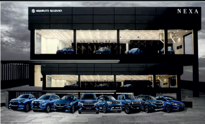
Nexa Showroom - Satara