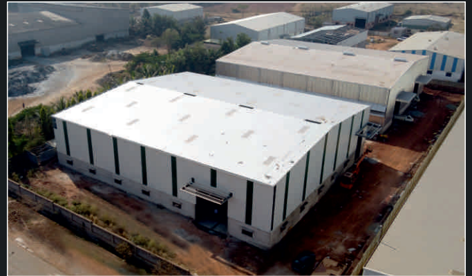
Veetech Valves - Gamangatti