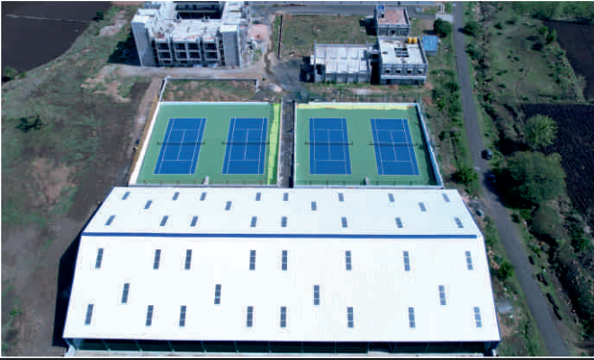
All India Sports Club - Belagavi