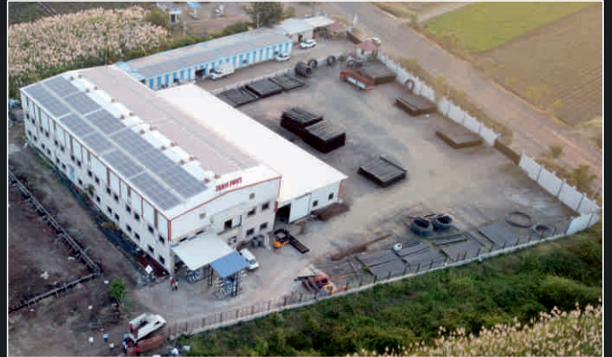
Tanvi Pipes - Athani