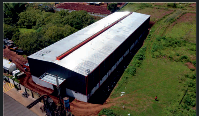
IH Casting - Belagavi