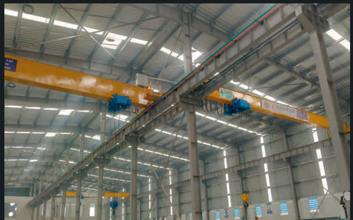
Multiple EOT Cranes