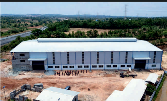
Sthira Technovation - Dharwad