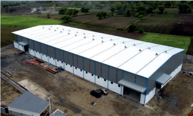
Attar Steels Unit 2 - Belagavi