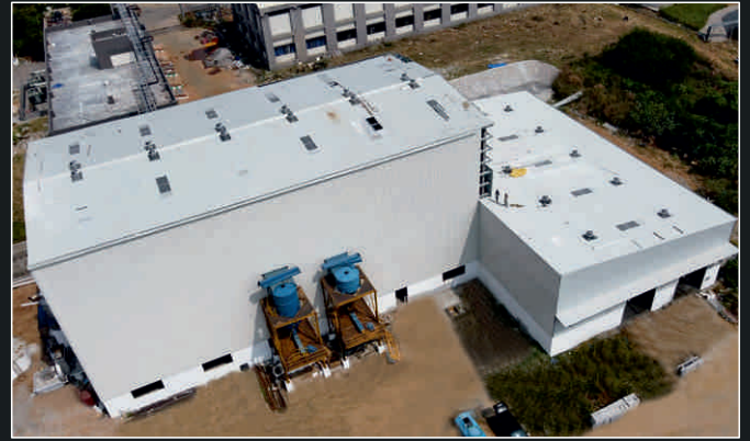
KMF - Kanakapura