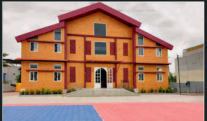
Flomont World School - Bangalore