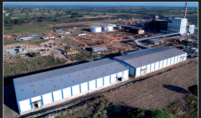
Inamdar Sugars - Bailhongal