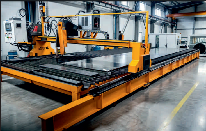
CNC cutting machine