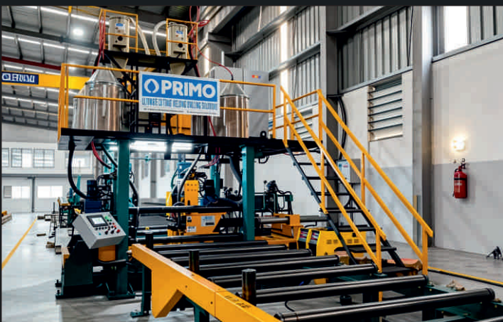
Pull through welding machine [PTW]