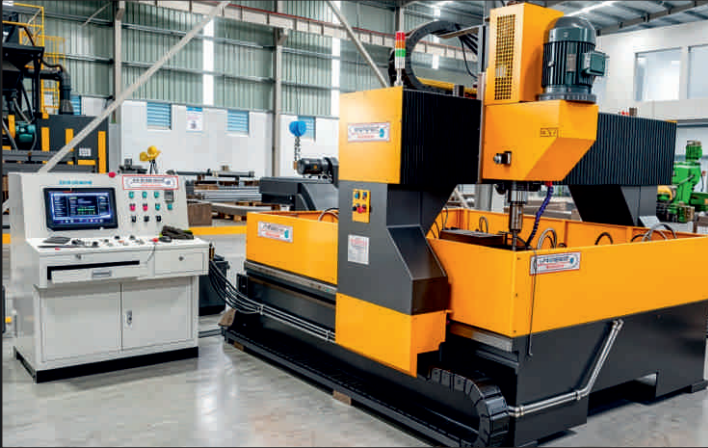
CNC drilling machine