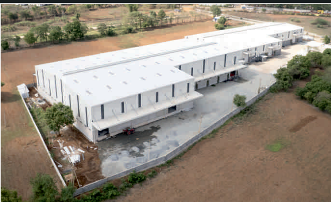
Koliwad Estates - Hubli