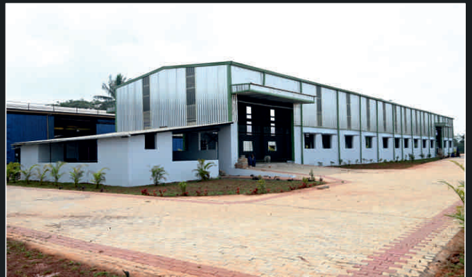
DI Castings - Belagavi