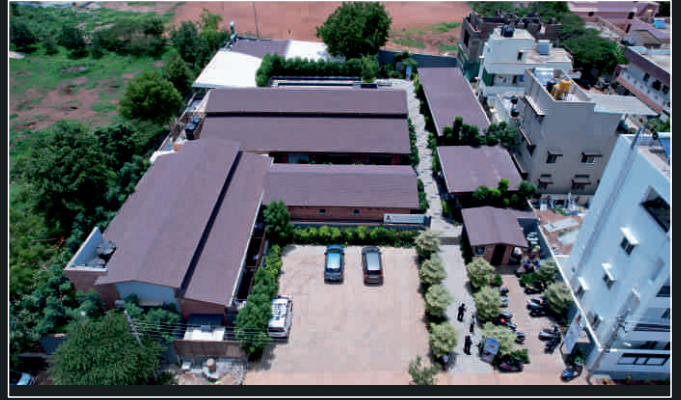
Vishwachetana Patanjali - Hubli