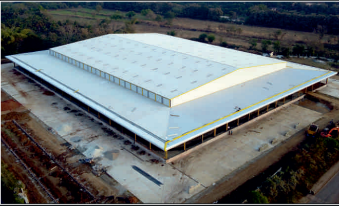
VRL Logistics - Hubli