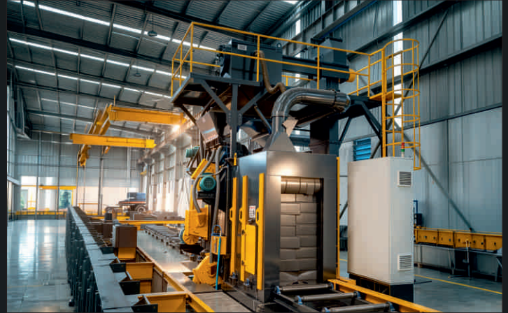
Shot blasting machine