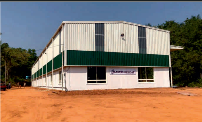
Aryama Concepts - Bangalore