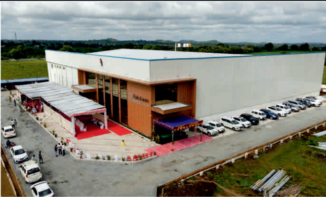
Raksham Medical Devices - Hubli